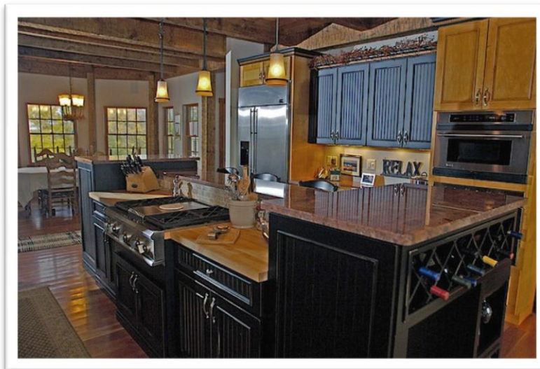
Elegant Rustic Kitchen with Tiered Island

What do you like most about your current kitchen?