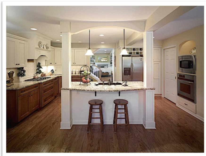
Kitchen with Central Island