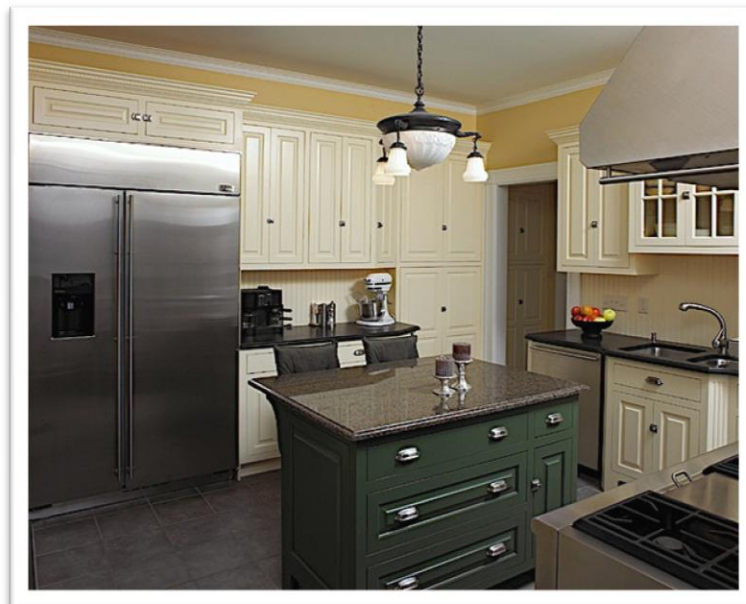
Kitchen With Commercial Refrigerator