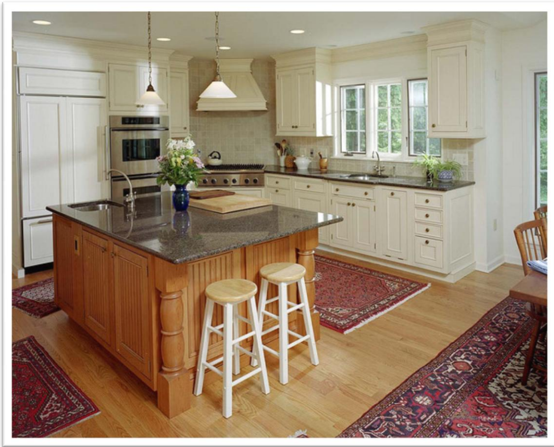
White Kitchen with Island

The answer to this question will help you to decide what changes you will want to prioritize in planning a budget.