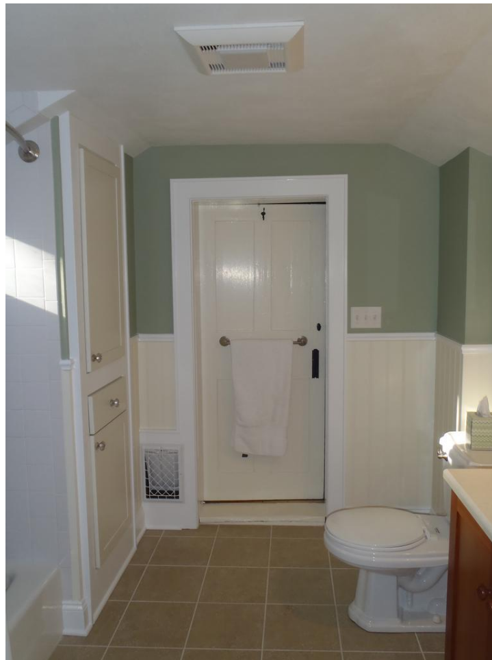
Bathroom Ventilation and Fan Lighting

Walk-in showers without doors do not require any special bathroom ventilation . New bathroom ventilation fans feature better blade design and high performance motors that are more efficient and quieter. There are also models that offer low-level lighting and/or a night light. If the walk-in shower space is large enough, ventilation and lighting can be installed in the ceiling outside of the shower stall. You may wish to consider using a bathroom fan with a humidity sensor.