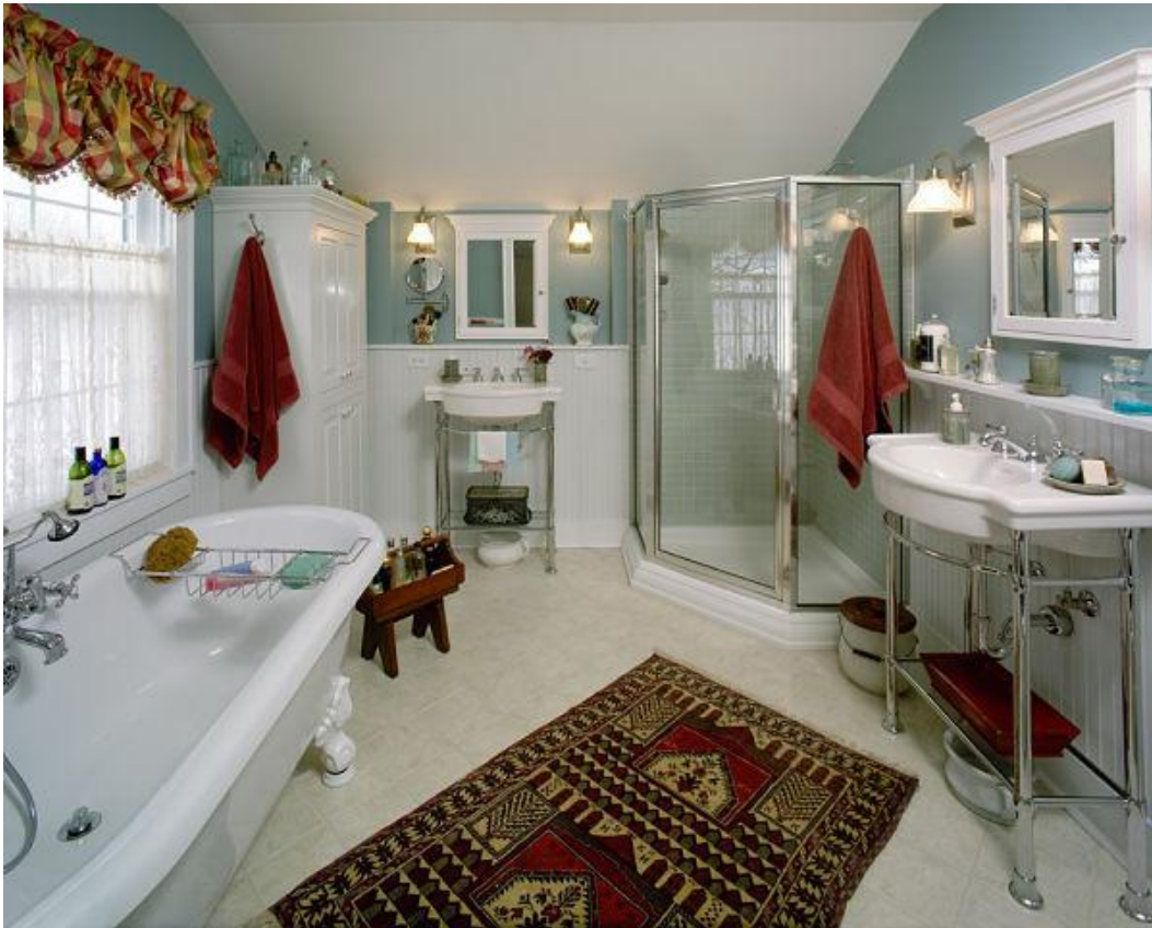
Neo-angle Walk-in Shower with Prefabricated Base

Some homeowners are using acrylic prefab shower bases with custom surrounds because of the durability of acrylic and its easy maintenance. Acrylic is seamless, slip-resistant and will not crack like tile flooring may in a shower, plus there is no grout to clean. Prefabricated bases are also less expensive than a custom base.