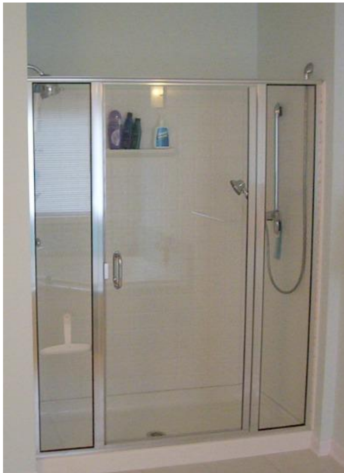
Prefab Walk-in Shower with Hinged Glass Door

Prefab shower stalls come in several models for assembly. One-piece units are large and sometimes difficult to get into a room. Two- or three-piece stalls make the logistics of moving the unit easier. Some units may contain a shower base while others may require a separate base. Doors are usually purchased separately. Options include a shower bench, soap dishes and storage shelves, grab bars and offset controls placed away from the water stream to minimize the risk of scalding.