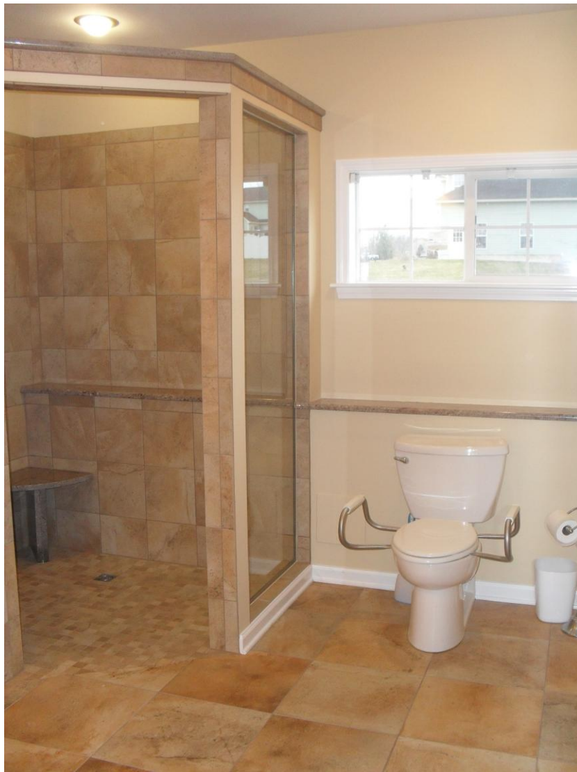
Doorless Walk-in Shower with No Threshold

To eliminate the threshold, a sloped floor is required in the shower, which both of these options allow for. Water should drain easily and not puddle on the floor.