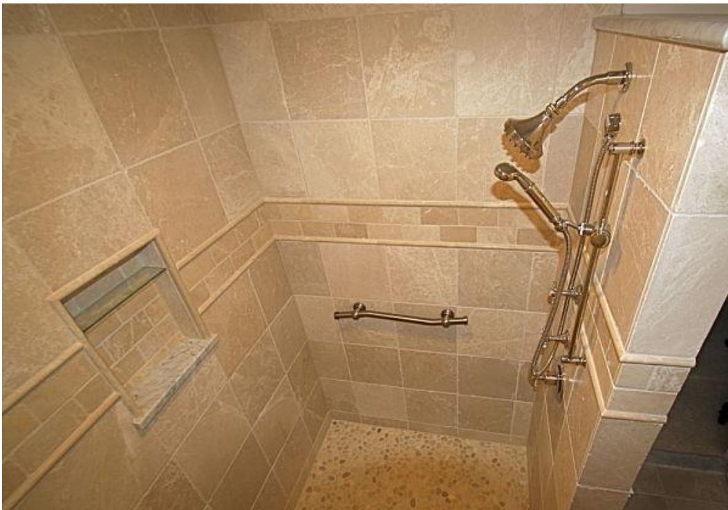
Doorless Walk-in Shower with Marble Tile Walls and River Rock Tile Floor www.McClurgTeam.com

If you want a walk-in shower with doors, and have a bathroom space where door swings will not present a problem, consider hinged doors. Hinged doors can be wiped down with a glass cleaner and debris build up in the frame is less of a problem. Another popular option for custom walk-in showers is a wall/base kit from Onyx . Onyx produces bases in many shapes and sizes that will fit virtually any space. They also offer configurations for showers with and without doors .