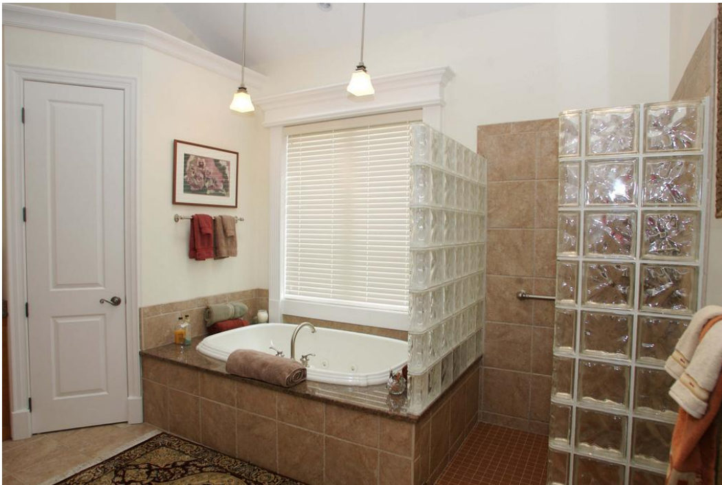
Doorless Walk-in Shower with Block Glass Walls

Eliminating the shower door can help optimize space in a small bathroom because you don't have to factor in the door swing in determining the placement of other fixtures. In a large bathroom, the shower location becomes a "shower room" when separated by a partition wall of tile or glass.